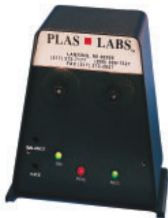
#800-AS/SPI Anti-Static unit

This device is perfect for working with fine powders and chemicals.